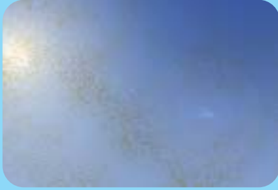
1. The window is exposed to daylight