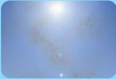
2. Daylight triggers the Pilkington Activ ™ coating