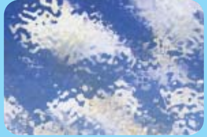
4. Rainwater hits window and sheets down glass