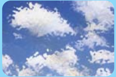
5. Dirt is washed away by rain