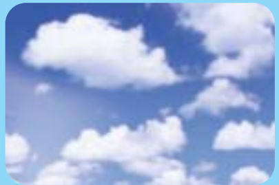
6. Window is left clean