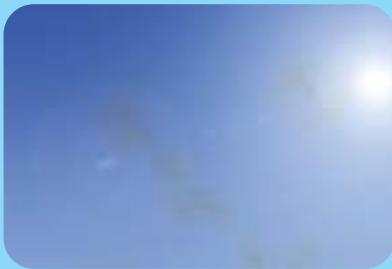
3. Reaction loosens organic dirt